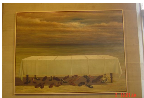
The Witnesses by Graeme Drendel