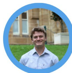
Hudson Eichorn Community Building Portfolio