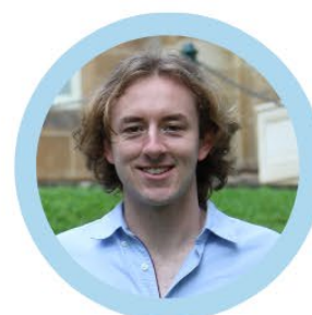
Woody Whitford Community Building Portfolio