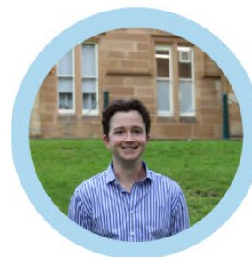
Gian Wynn Wellbeing Portfolio